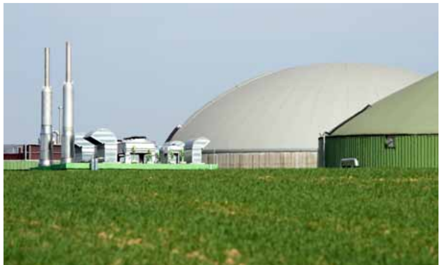
Biogas energy plant in Germany. Biogas already provides more than 3% of the whole of Germany's electricity consumption, as well as significant amounts of industrial heat, transport fuels, and volume injected into the natural gas grid.

Currently the modern biogas production industry is just at the beginning of wider implementation. With the exception of a few countries, like Germany (which are