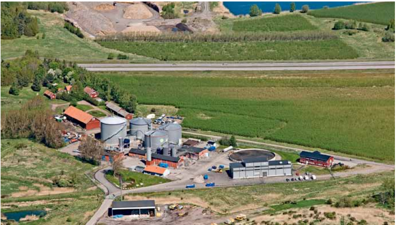
The biogas plant in the municipality of Linköping, Sweden. Sweden is a world leader in upgrading and use of biomethane for transport. Biogas covers today 1% of the total road traffic in Sweden.